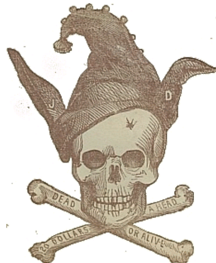
A CONFEDERATED DEADHEAD

Donations of Civil War books for the sale are being accepted at the Museum. Receipts are available for tax purposes. All proceeds benefit Fort Ward Museum and Historic Site.